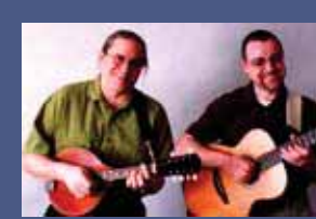
The Kerry Boys